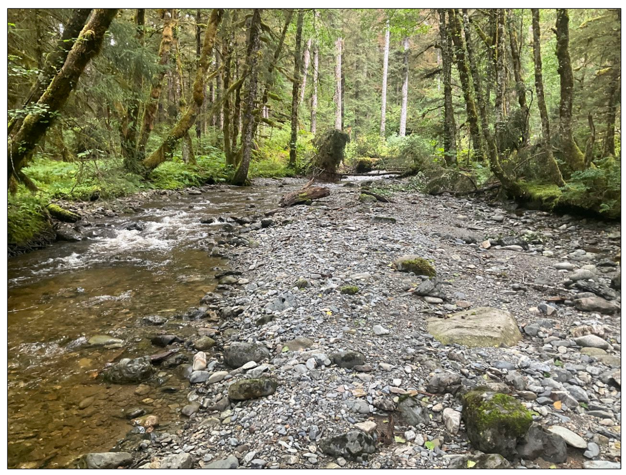
Figure 2.-Channel at waypoint 1448 facing upstream.