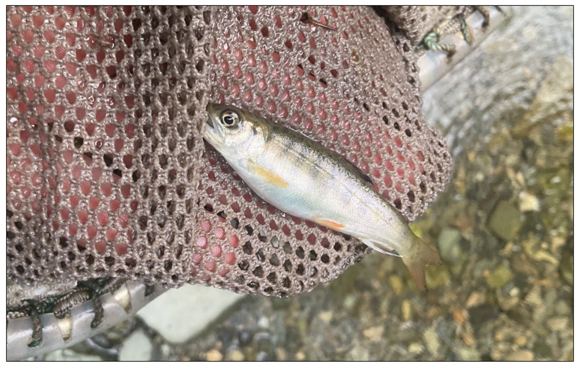
Figure 1.–Juvenile coho captured at waypoint 1448.